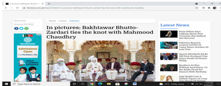
Photograph. 1. Headlines from The News online Newspaper

Bhutto Zardari ties the knot with Mahmood Chaudhry’ and proceeds to uses persuasive writing to engage readers’ attention. This statement is basically considered to be formal writing which is used for the journalisms. As in shown in picture below: