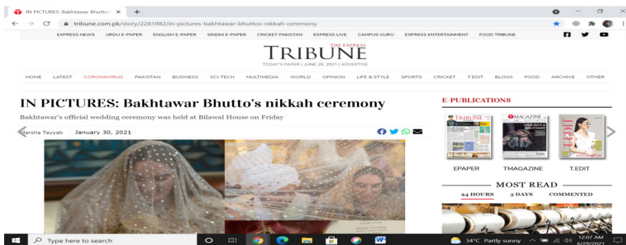
Photograph. 2. Headlines from The Express Tribune Online Newspaper

Tribune news article heading is started with name of bride in a very simple language ‘Bakhtawar Bhutto’s Nikah ceremony’. This is also a mix of reporting as well as celebrity coverage where English is infused with the local touch as ‘Nikah’ is mentioned to encumbrance readers’ attention.